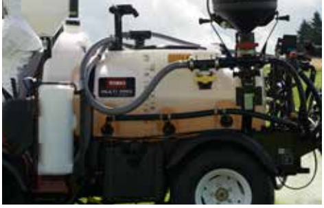
17.5 Gallon (66.2 litres) Fresh Water Rinse Kit

This on-board mixing station incorporates a venturi system and allows rapid and safe loading of any chemical without the need to first mix into a slurry. Incorporates a built-in bottle wash nozzle.